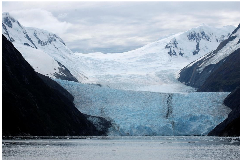
Seno & Glaciar Garibaldi

Leaving Caleta Gomez towards the yacht will enter the Paso Darwin, which was named by Captain Fitzroy in 1833 to commemorate Charles Darwin, the young naturalist that rose to fame for his theory about evolution. Darwin sailed on the Beagle during Fitzroy's second voyage in the southern seas, between 1831 and 1836. From here there are also stunning views of both the Cordillera Darwin and Isla Darwin.