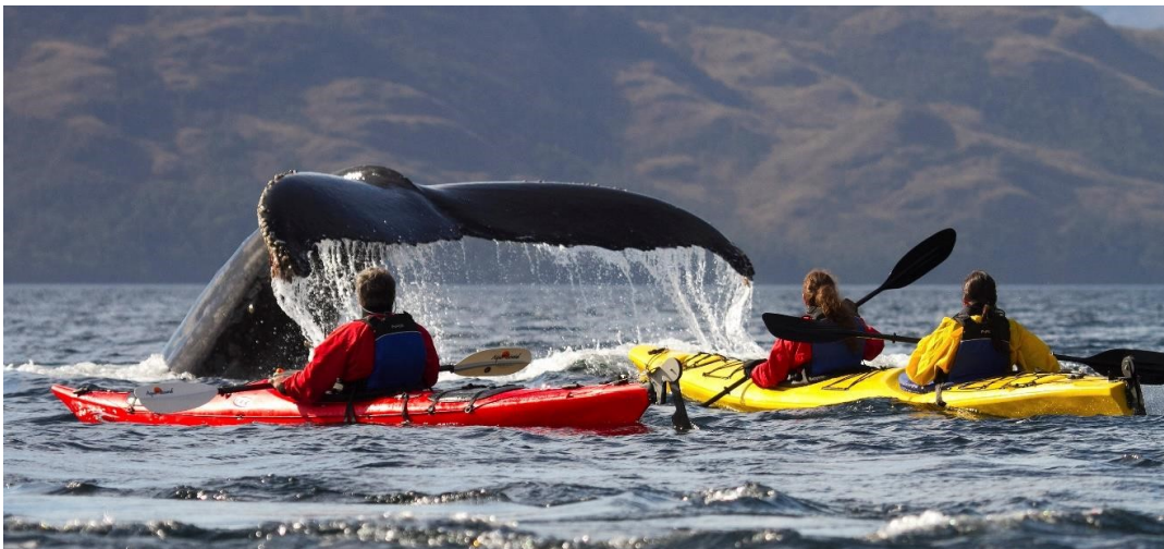
Whale watching at Parque Marino Francisco Coloane

The Park was created because it is part of a very important biological corridor, being the habitat of the famous humpback whale and occasionally sei whales during their feeding season. It’s also the natural habitat of different marine mammal species such as minke whales, orcas, sea wolves and sea elephants. The area also includes very important nesting areas which belong to the Magellanic penguin, and from here it is possible to watch the giant Antarctic petrel and imperial cormorant among others.