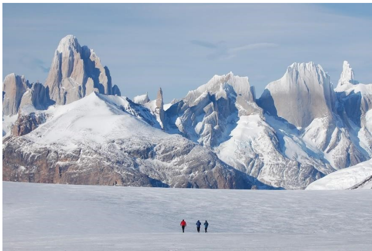
Campos de Hielo Sur

The Southern Patagonian Ice Fields (Campos de Hielo Sur) are where 49 glaciers originate, including the Pio XI glacier - inside Bernardo O’Higgins National Park - and the Glaciar Tyndall and Glaciar Grey, which visitors can see at the Torres del Paine National Park. Visitors can practice ice walking along the white paths and hiking along its steep walls.