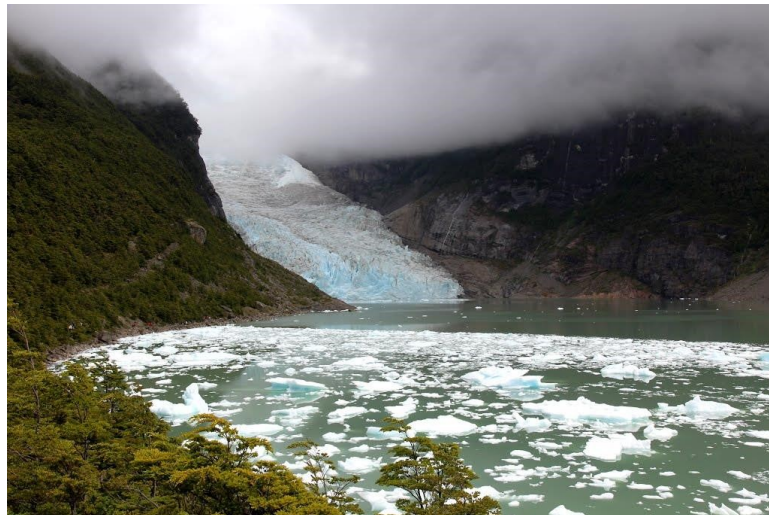
Bernardo O'Higgins National Park

In this park, the glaciers from the Southern Ice Fields are the main attractions and they invite to visit the areas on boats and to behold their magnificence. This is an area that keeps the purity of nature in the south intact, giving the visitors an unforgettable experience.