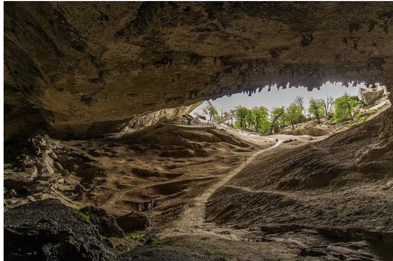
Cuevas del Milodon

Visitors will find a life sized replica of the famous mammal which the place is named after. Visitors can also take the time to have a picnic in the surrounding area, as there are special places to eat in the middle of nature.