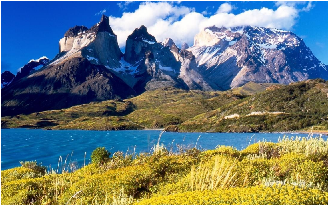
Torres del Paine

There is also terrific wildlife-watching in Torres del Paine, where majestic condors can be seen wheeling in the pristine skies overhead. While trekking visitors will come across foxes, huemules (Andean deer) and guanacos along the way, and if they lie in wait patiently, they might be lucky enough to spot the reclusive puma.