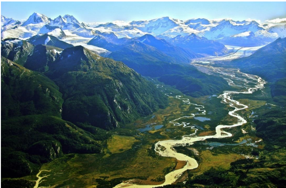
Yendegaia National Park

This amazing “piece” of wild nature at "the end of the world", which was formerly a cattle ranch, includes beech forests, vast grasslands, jagged coastlines, torrential rivers and sublime mountains making it one of the most spectacular places on the island of Tierra del Fuego.