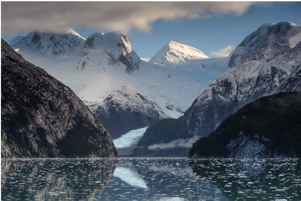
Seno Pia & Cordillera Darwin

Seno Pia is a long Y-shaped inlet hiding a magnificent tidewater glacier at the head of each arm. The entire inlet is particularly spectacular with high granite walls in all directions and sharp snowy peaks above.