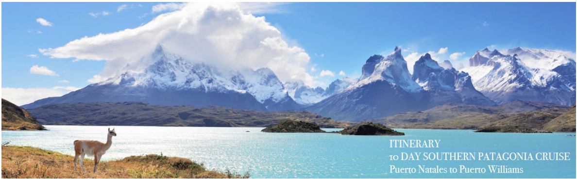
Seno Chico - Waterfall

Seno Chico is clear of dangers, with depths between 20 and 120 meters / 65 and 390 feet, high and steep cliffs surround this beautiful inlet. The inlet offers two anchorages, one of them being the Alakaluf Fjord, where at the end of this fjord there is a magnificent double-faced glacier.